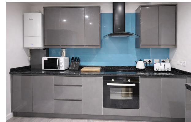
▼ Ground Floor